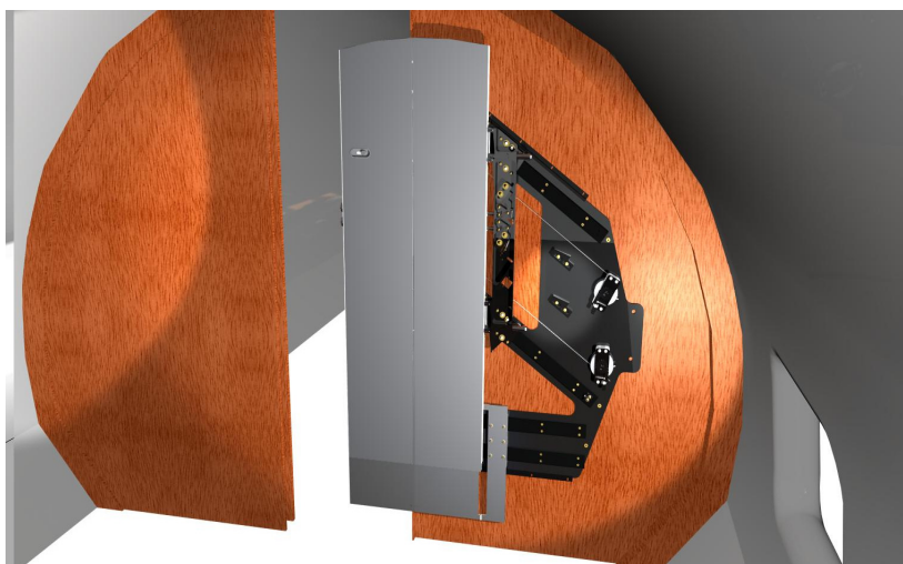
3519-184-3 MECHANICAL DOOR SHOWN

NOTE: DECORATIVE PARTITION MUST BE EASILY REMOVABLE FOR DOOR INSTALLATION AND ADJUSTMENT