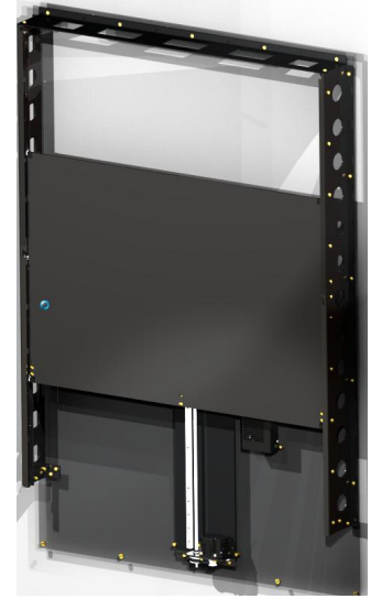
Monitor/artwork/finish material not included